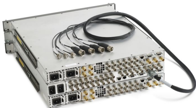
Option XLR adapter cable