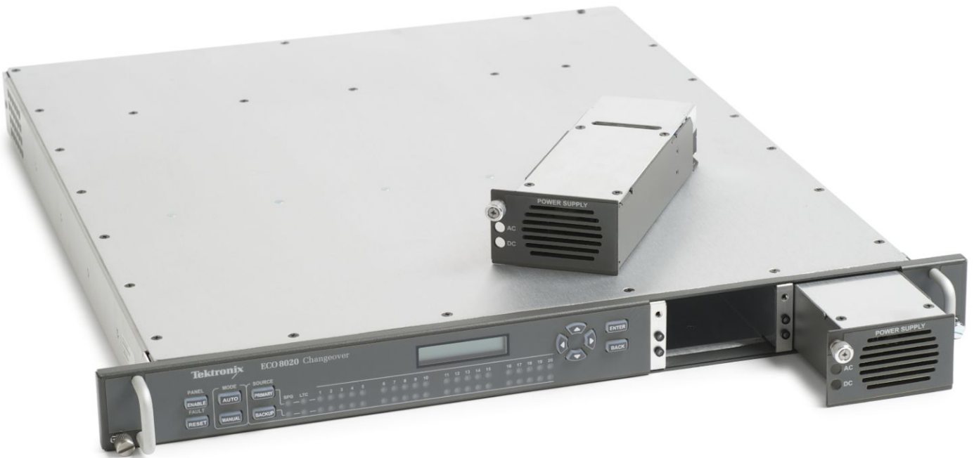
Option DPW backup power supply