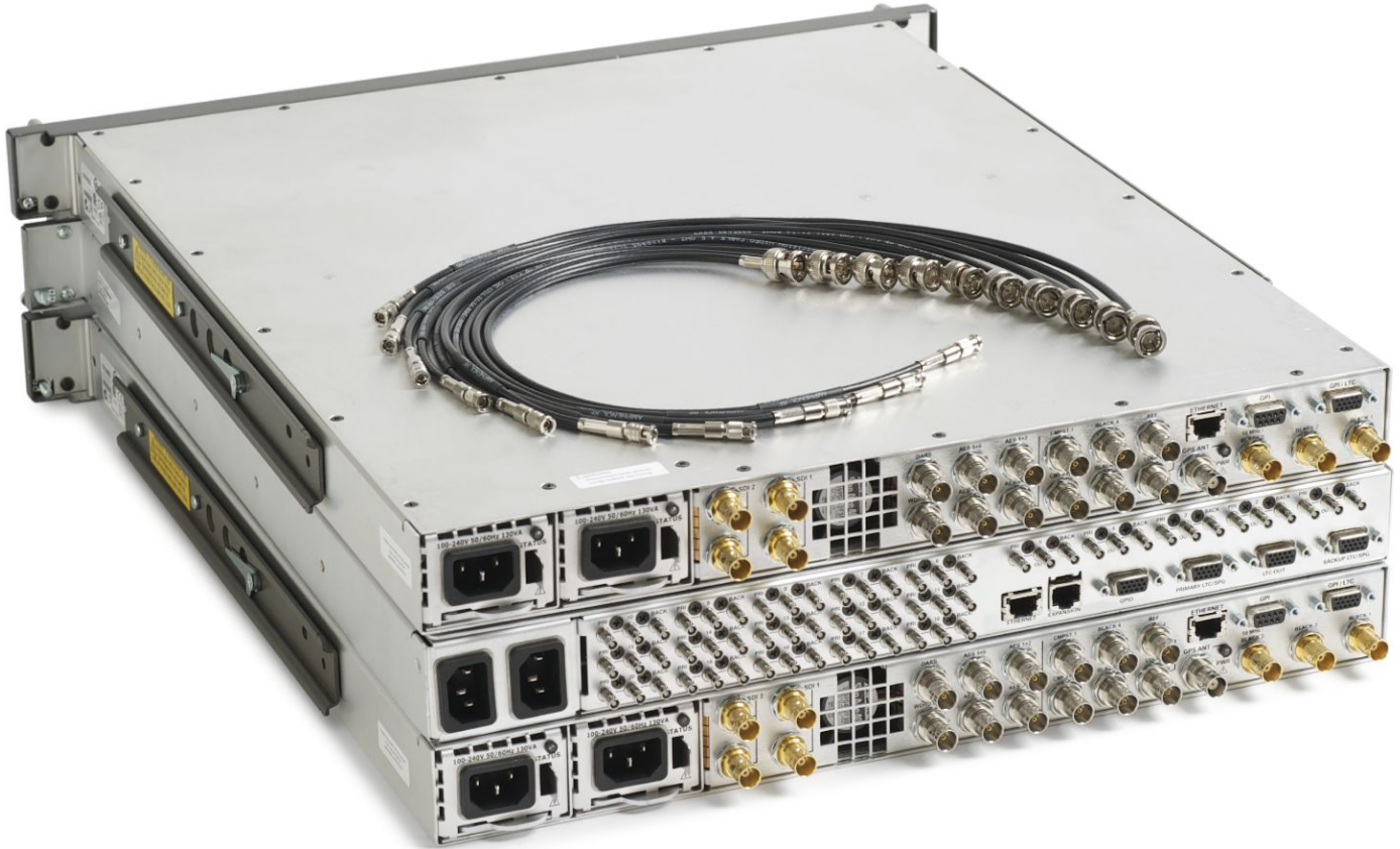
Option CBL adapter cable