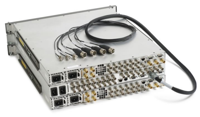
Option XLR adapter cable

IFC Service installation and calibration